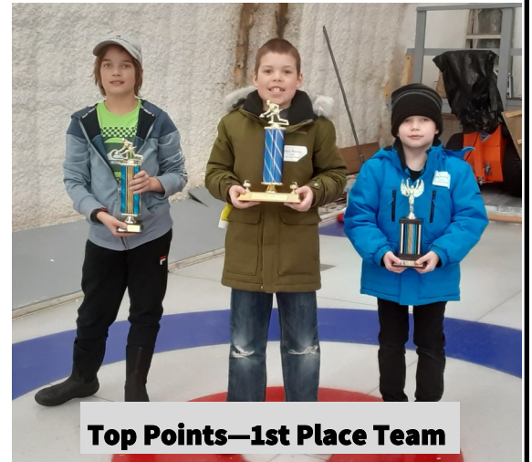
Top Points—1st Place Team